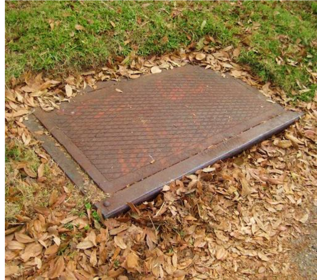
CLOGGED STORMWATER DRAIN