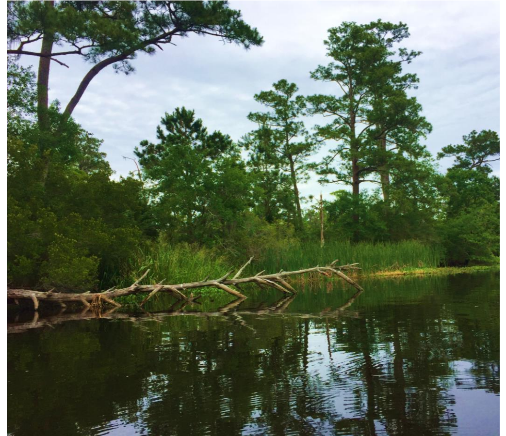
CANE BAYOU, ST. TAMMANY PARISH