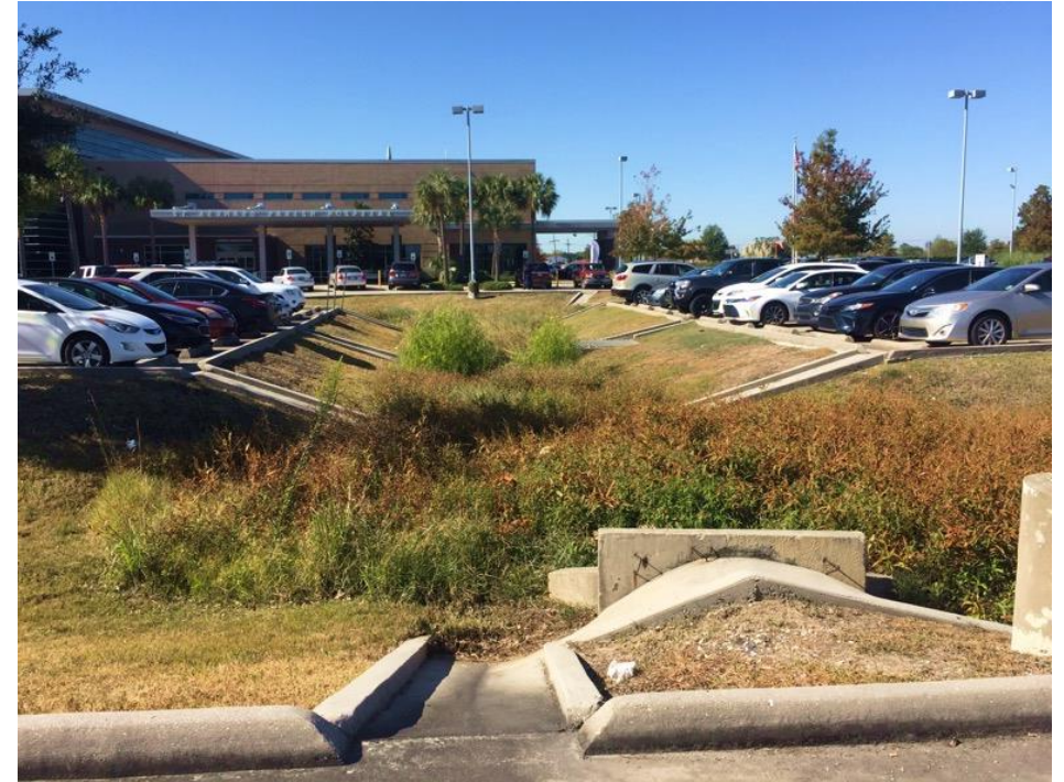
FLOOD MITIGATION PROJECT IN ST. BERNARD PARISH