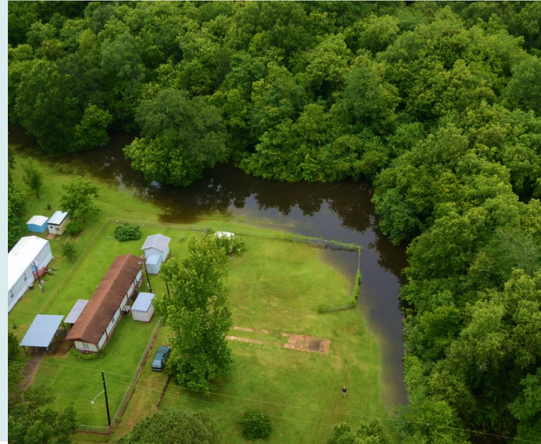
MARCH 2015 FLOOD IN ALEXANDRIA